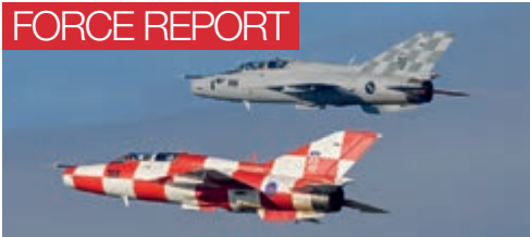
Croatian Air Force The Balkan air arm looking West