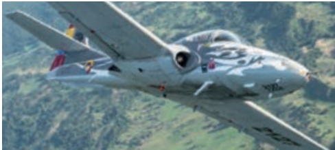
Colombian Tweets The last T-37s in the Americas