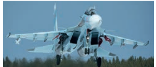
Live-fire Flankers On the range for Exercise Ladoga